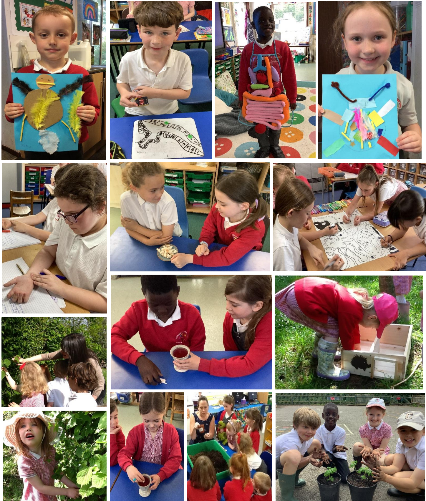
Photo Diary of the Week

GRATITUDE RESILIENCE OUTREACH WONDER TRUST HARMONY