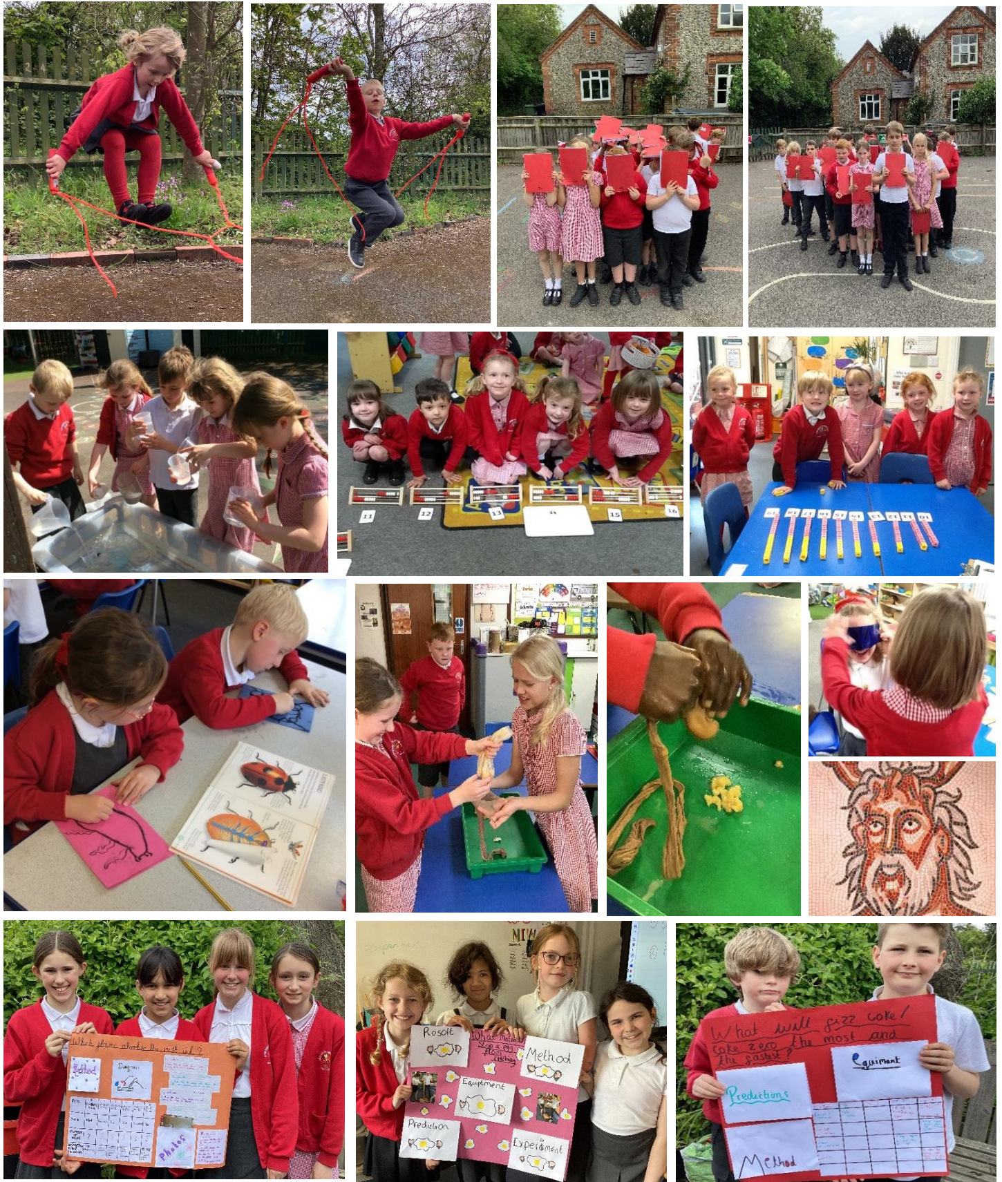
Photo Diary of the Week

GRATITUDE RESILIENCE OUTREACH WONDER TRUST HARMONY 'Let your roots grow down into him, and let your lives be built on him.' Colossians 2:7