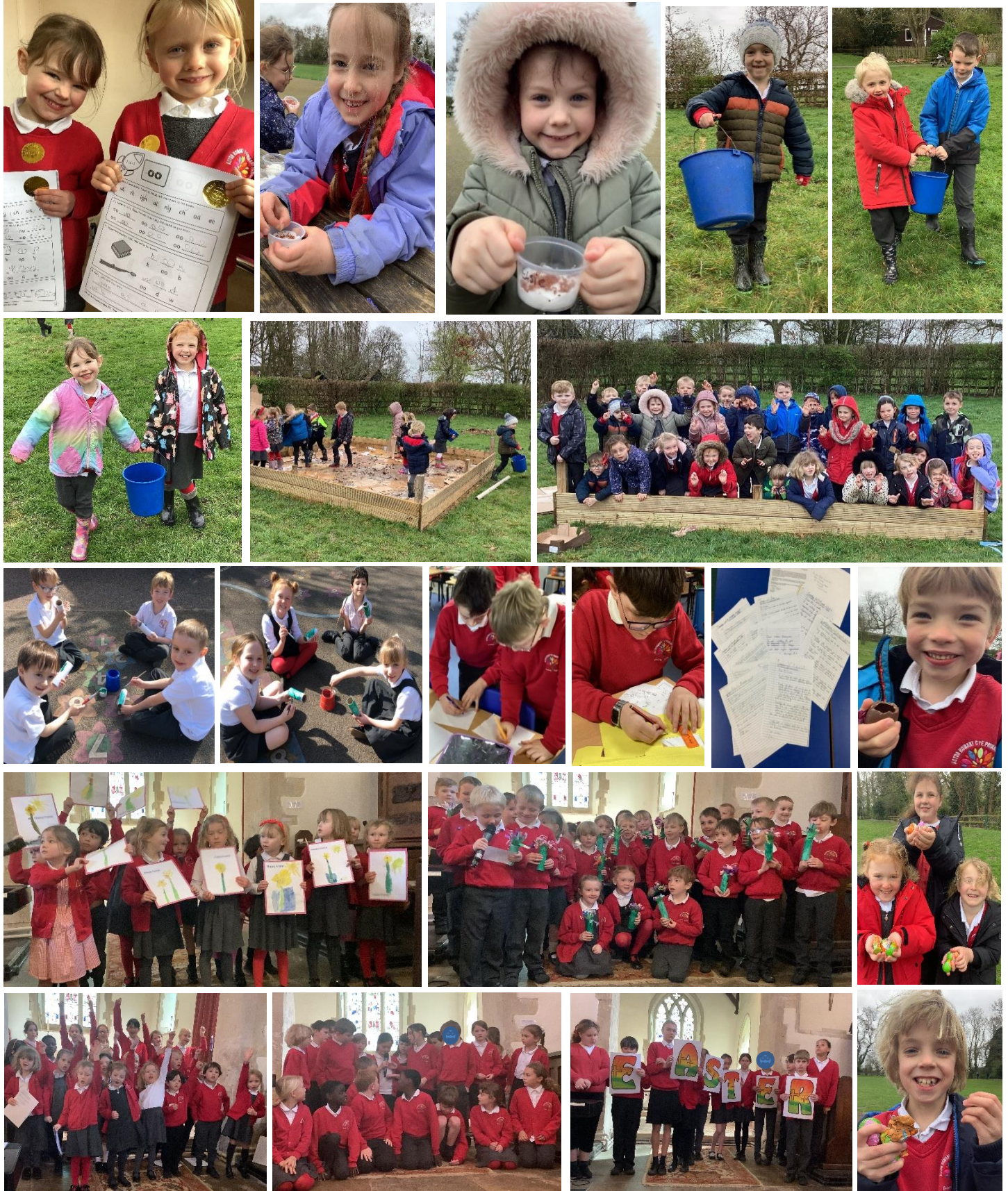
Photo Diary of the Week

GRATITUDE RESILIENCE OUTREACH WONDER TRUST HARMONY