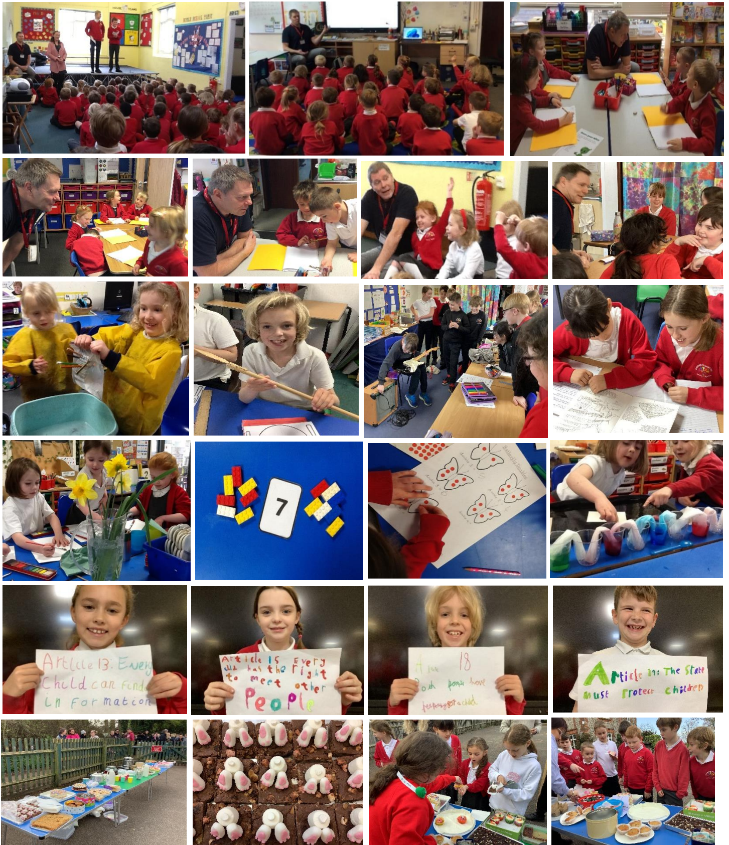
Photo Diary of the Week

GRATITUDE RESILIENCE OUTREACH WONDER TRUST HARMONY