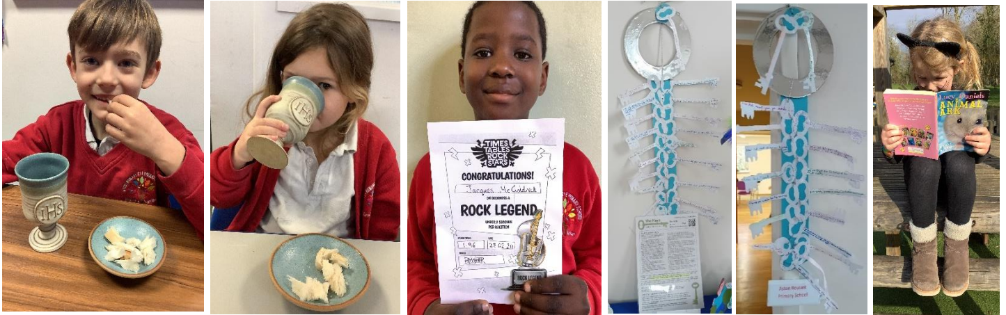
Photo Diary of the Week