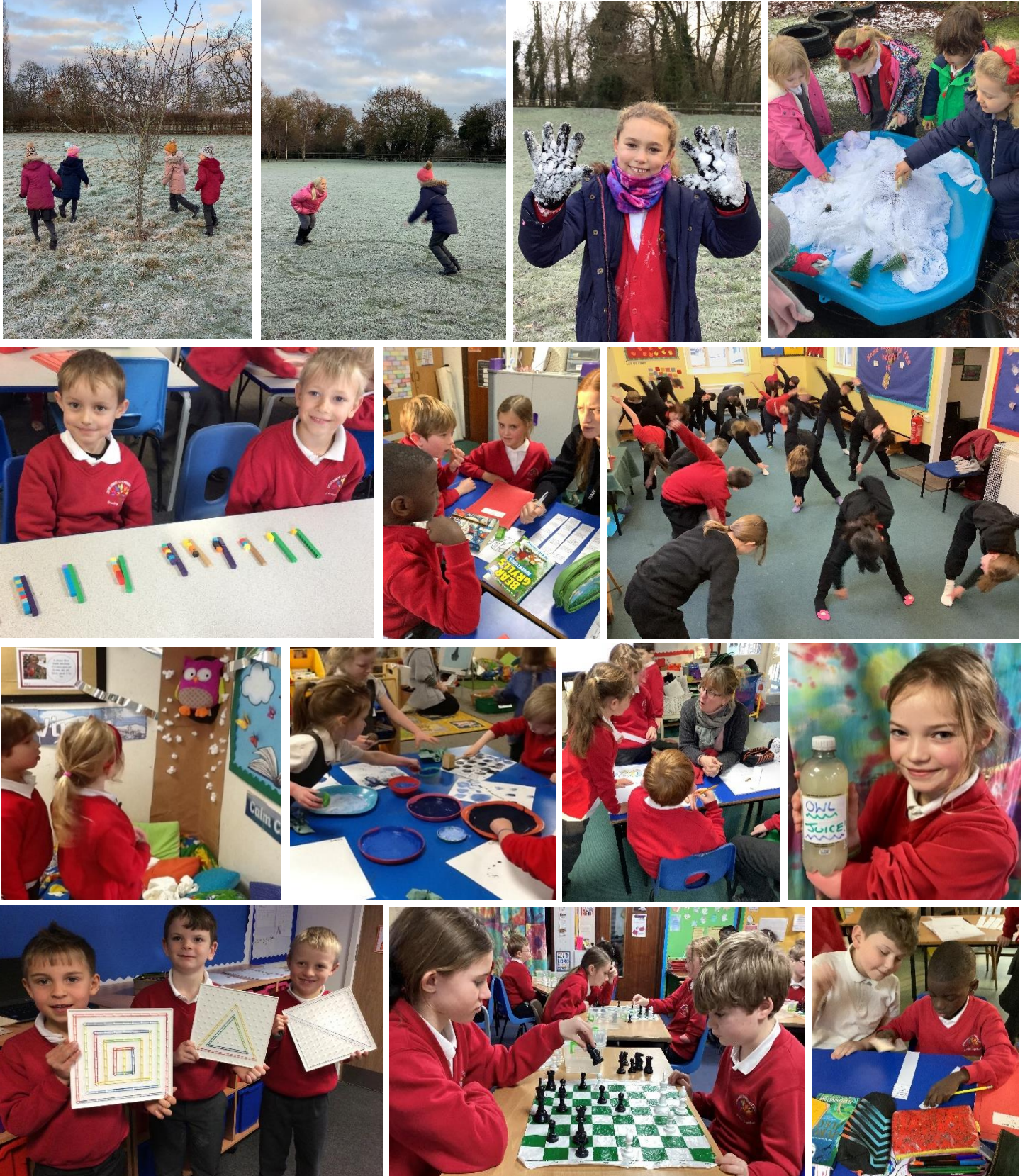
Photo Diary of the Week

GRATITUDE RESILIENCE OUTREACH WONDER TRUST HARMONY