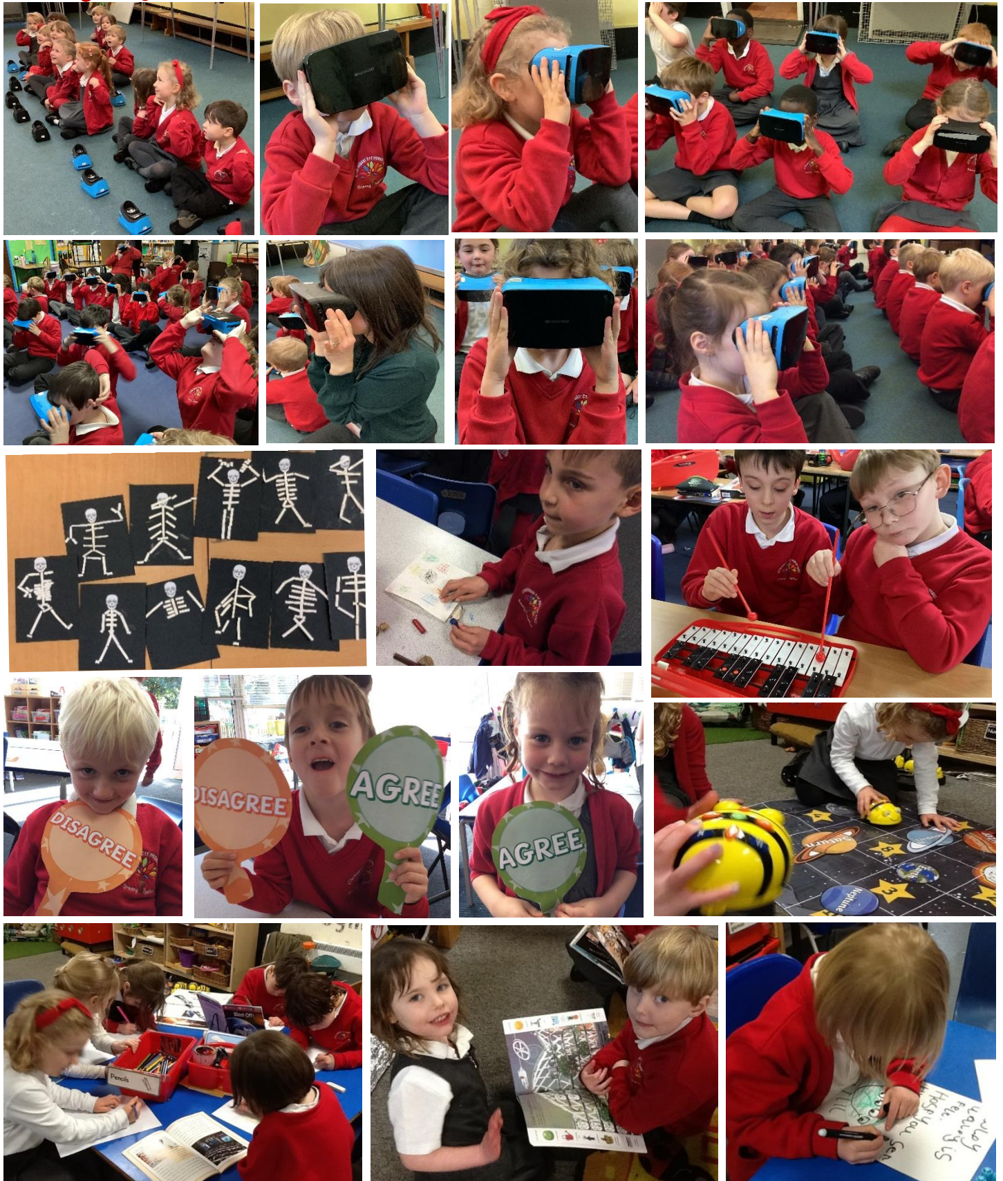
Photo Diary of the Week

GRATITUDE RESILIENCE OUTREACH WONDER TRUST HARMONY