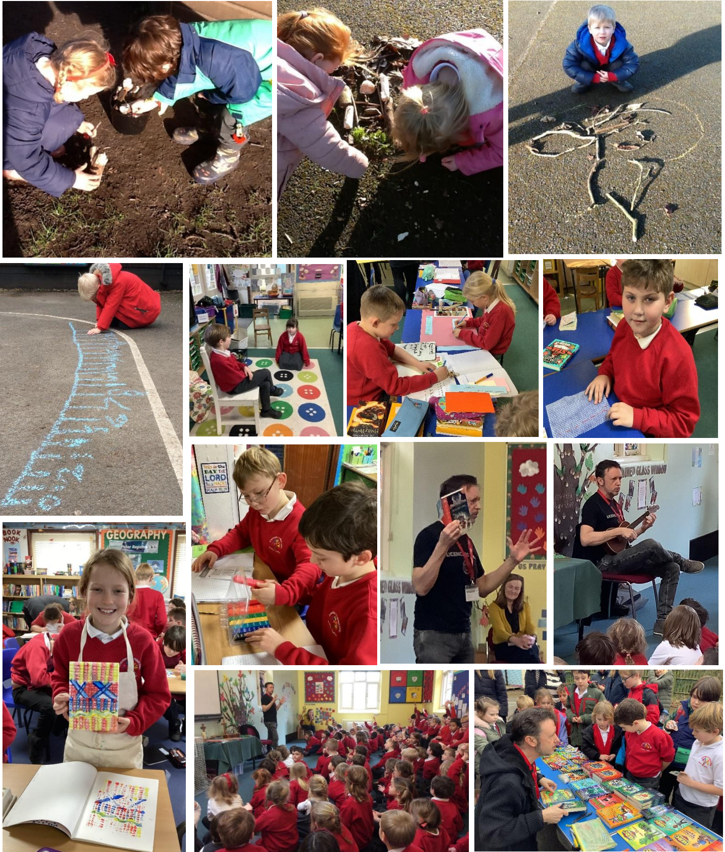
Photo Diary of the Week