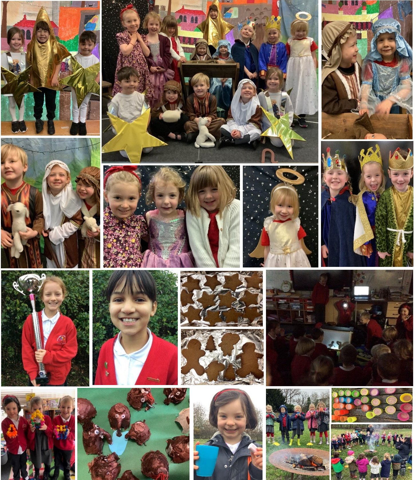
Photo Diary of the Week

GRATITUDE RESILIENCE OUTREACH WONDER TRUST HARMONY