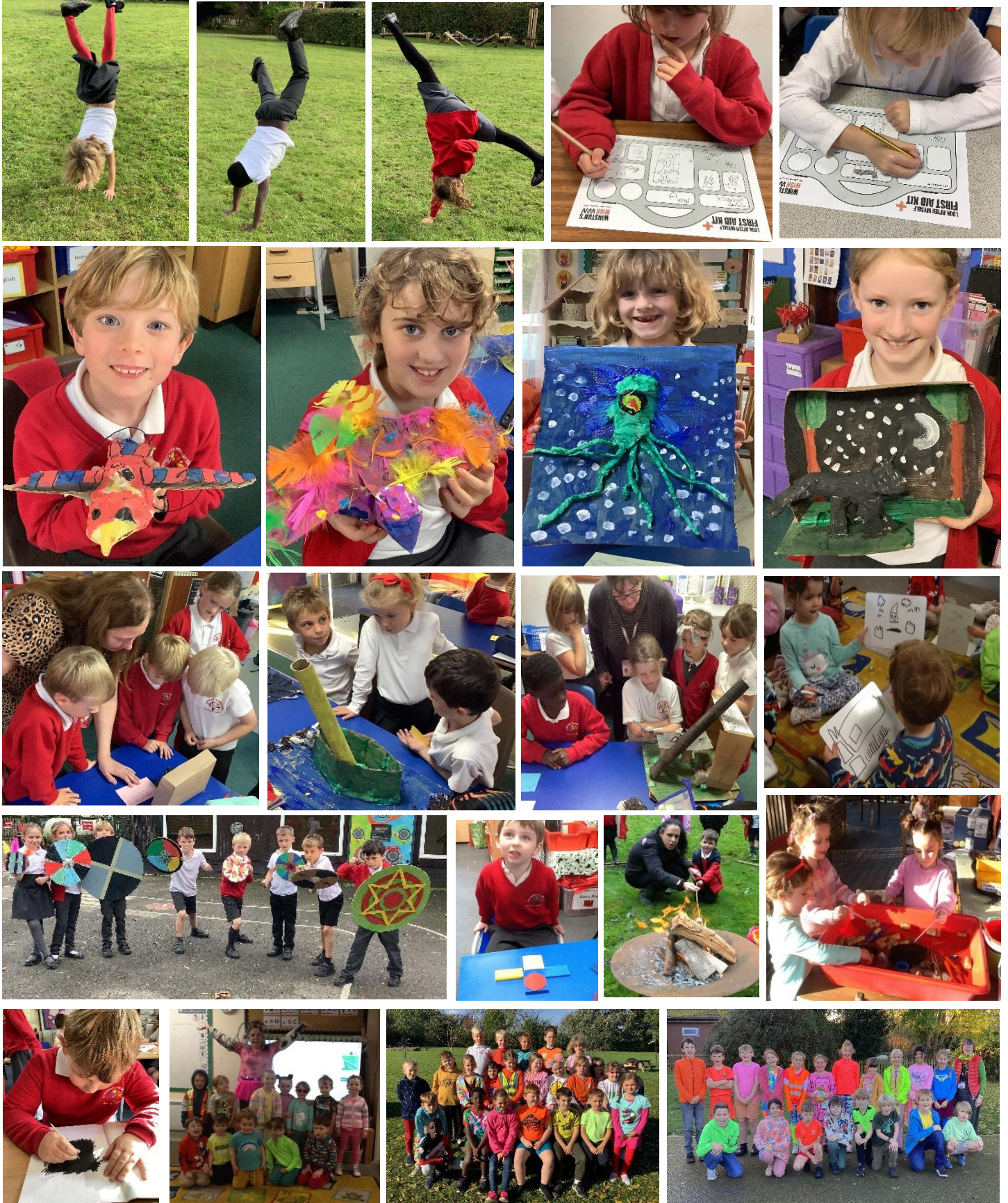
Photo Diary of the Week