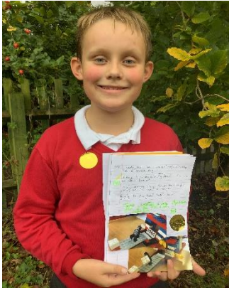
Photo Diary of the Week