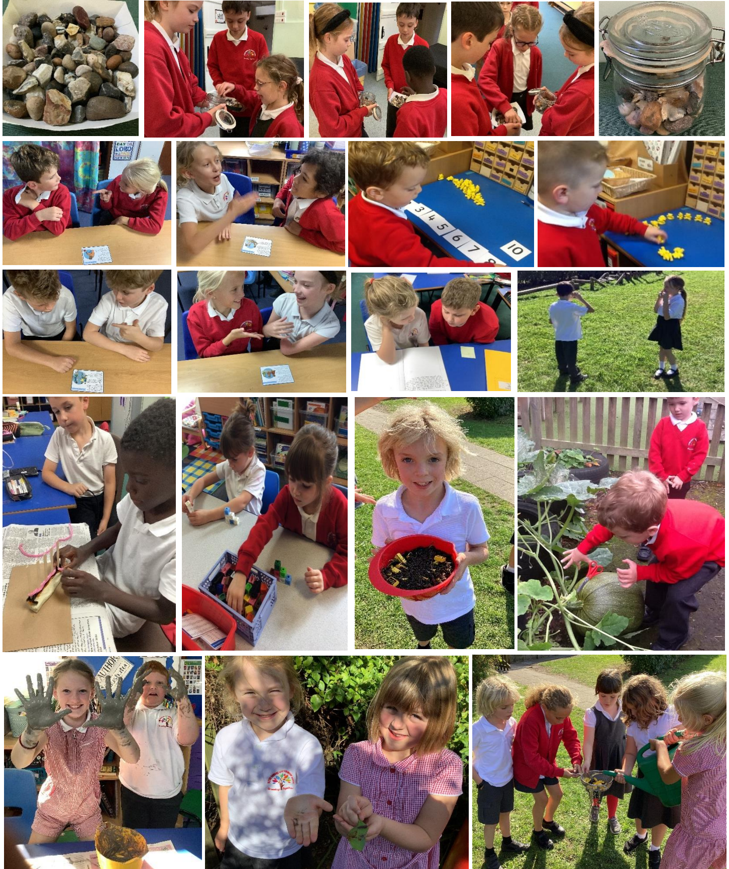
Photo Diary of the Week