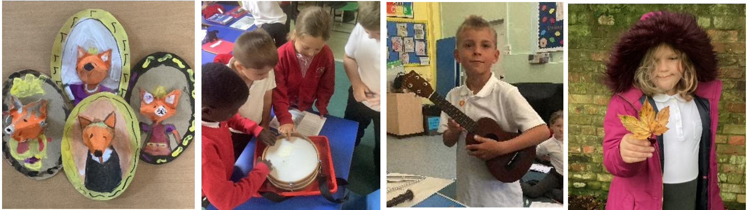
Photo Diary of the Week